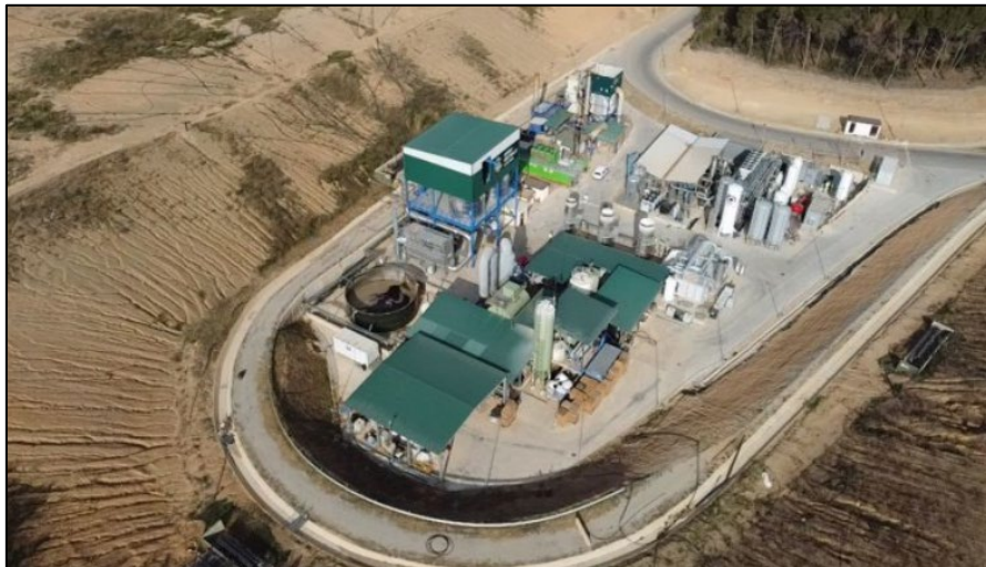
Overview of the biogas management area, where the biomethane production unit has been installed, at the Can Mata controlled landfill (Barcelona).

June 22, 2023 - PreZero Spain, a leading environmental services company specialized in delivering municipal services and developing circular economy solutions, and Waga Energy, a European company specialized in producing biomethane from controlled landfills, have commissioned Spain's largest project to produce biomethane from biogas generated by the degradation of waste in a controlled landfill. This renewable gas is injected directly into the grid operated by Nedgia, the Naturgy group's gas distribution company, via a 6-kilometer pipeline built as part of the project.